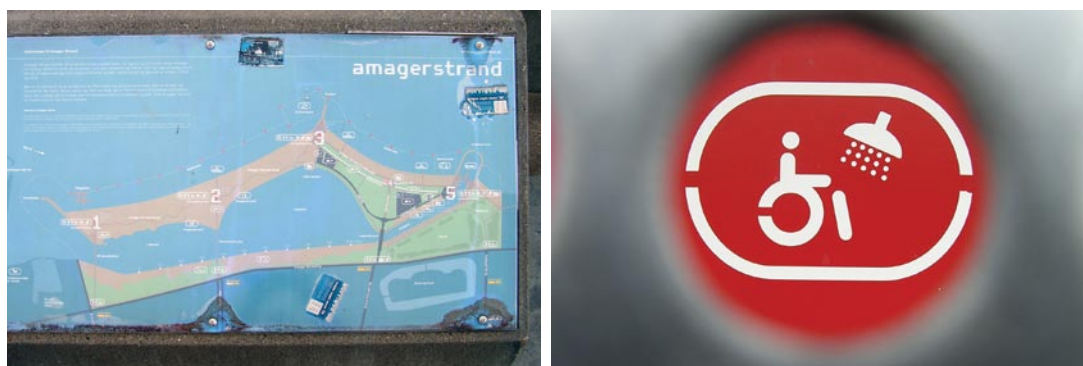
Figure 1. & 2. Information at the entrances and signing all accessible services is of high importance

At the entrance of the site accessible parking places are necessary for cars, vans and – in the case of hosting visitor groups – buses. The area should be accessed by public transportation as well. The waterfront and other tourist attractions of the site must be available from the accessible parking places. At the entrances detailed information must be placed with the directions, attractions, basic services, wheelchair-accessible accommodations, routes and activities, etc., which can be founded in the site. If it is possible build accessible routes to the waterfront maximum after every 500 m.