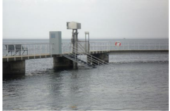
Figure 7. & 8. Access to the water via from a wooden jetty via ramp, staircase and pool lift