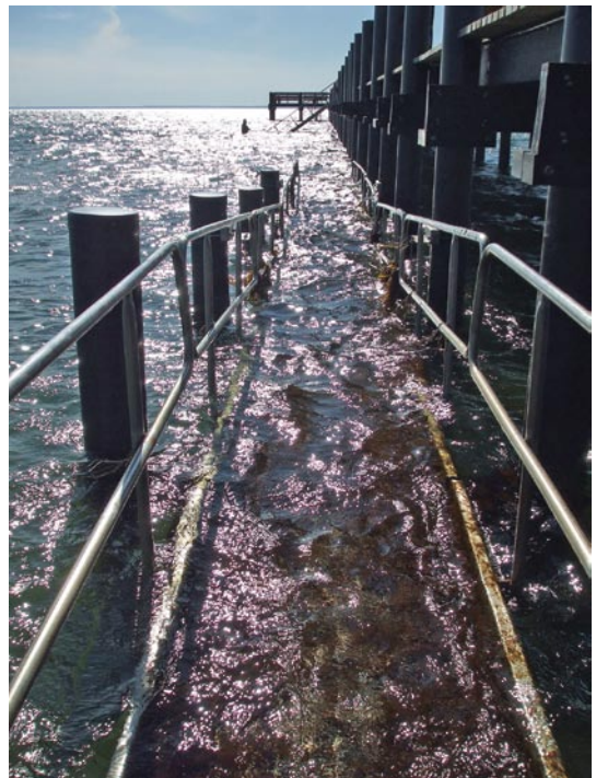
Figure 9. & 10. The jetty is a wood construction with safety railings and edges, and the underwater part is a metal construction

Bathing pontoons should be as stable as possible, and must be equipped with safety railings. The level difference between the water surface and the pontoon's or jetty's surface should be moderate, and so should be the level difference between the bank and the pontoon or jetty. [17]