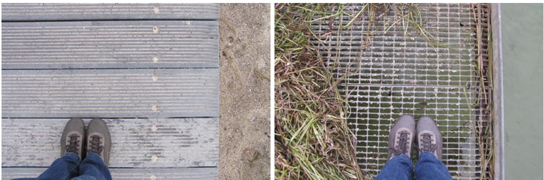
Figure 5. & 6. Most often used materials on waterfront landscapes are concrete, wood and metal – besides the good quality, maintaining is also an important issue