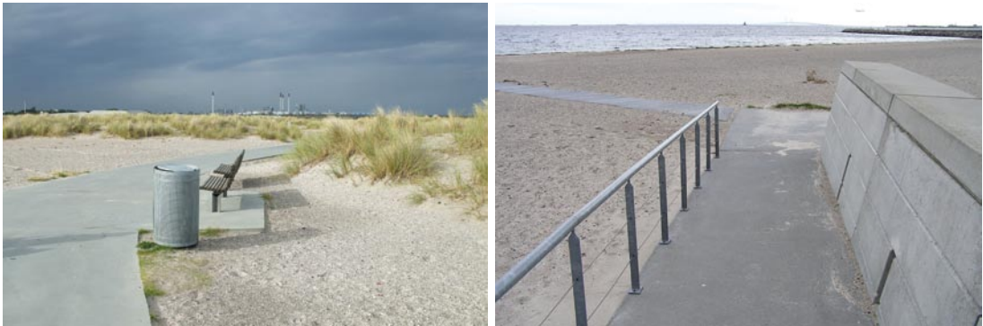
Figure 3. & 4. Compacted paths are preferred by all visitors, because it is hard to walk or drive on soft surfaces like sand or gravel